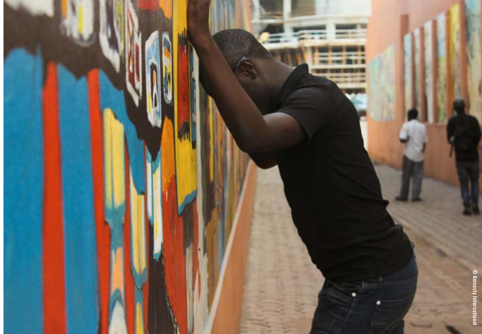
Left: Downtown Yaoundé, Cameroon, May 2013. A young man who has been frequently beaten in his neighbourhood and evicted from his home, because of his sexual orientation and gender identity.

Sexual and reproductive health and rights, gender equality and women's empowerment were acknowledged as key to development in 1994 at the International Conference on Population and Development (ICPD) in Cairo, Egypt. Leaders of 179 countries, representing all regions of the world, adopted a historic Programme of Action. The Cairo Programme reaffirms those rights set out in various international human rights treaties, and sets standards for their implementation for governments and donors.