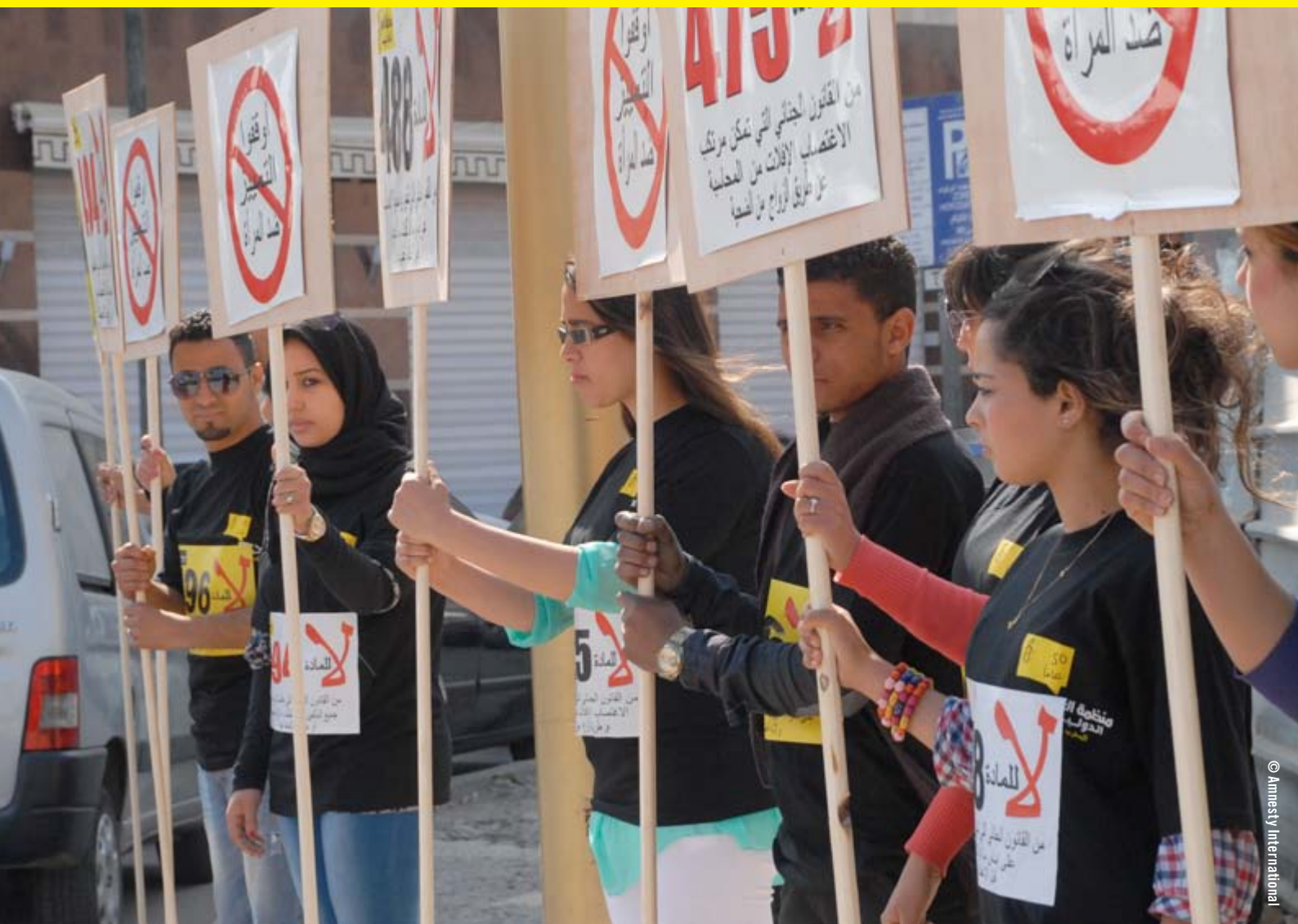
Image: Amnesty International activists in Morocco protest against Article 475 of the Penal Code and other provisions that discriminate against women, May 2013. Until its amendment in January 2014, Article 475 allowed rapists to walk free if they married their teenage victims (see inside, page 10).

Amnesty International is a global movement of more than 3 million supporters, members and activists in more than 150 countries and territories who campaign to end grave abuses of human rights.